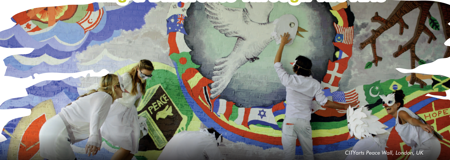
CITYarts Peace Wall, London, UK

JUNE 23rd 2021 The Metropolitan Pavilion 125 W 18th St, New York, NY 10011 6:00 - 9:00 PM